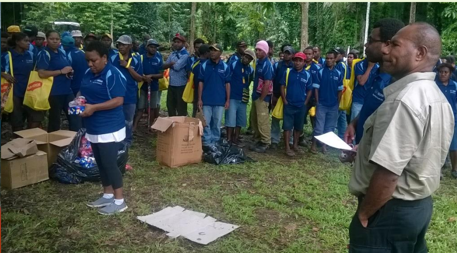
Nestle helps to clean up the grounds