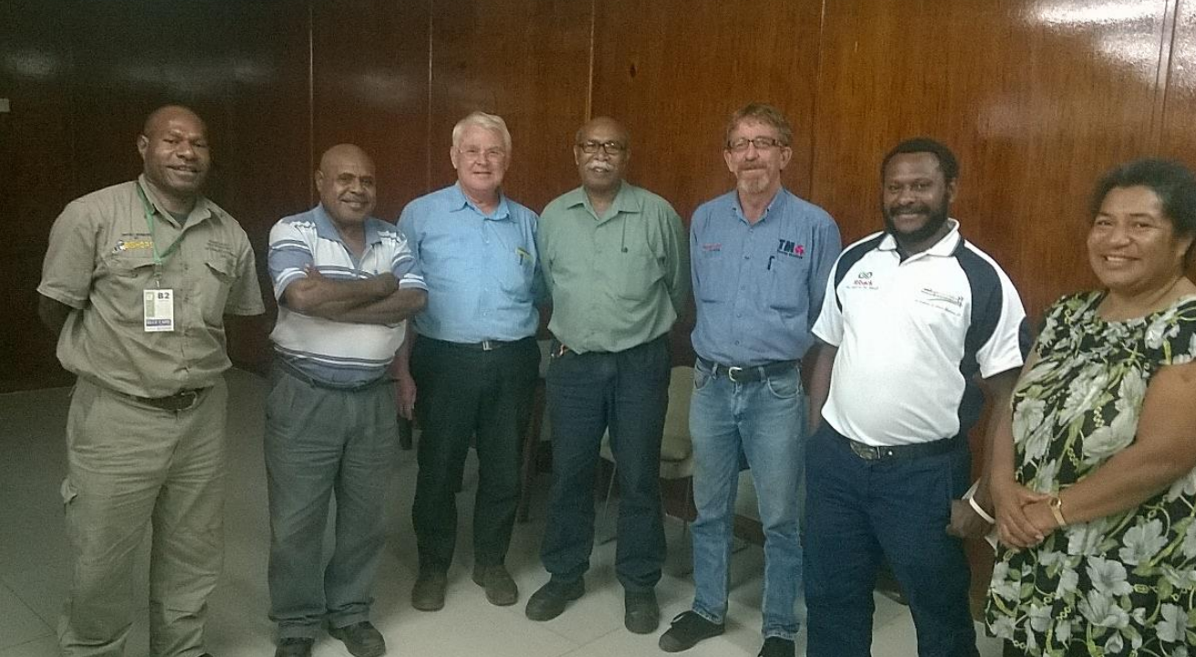
Governance and partnership structures enhanced